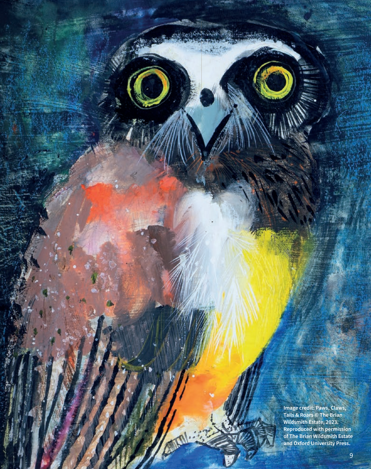
Image credit: Paws, Claws, Tales & Roars © The Brian Wildsmith Estate, 2023. Reproduced with permission of The Brian Wildsmith Estate and Oxford University Press.

For the first time Brian's personal collection of over 40 colourful original illustrations, early works, drawings and paintings will be on display in the beautiful setting of the Cooper Gallery. The walls will be filled with colour and vivid characters. It's a perfect destination for art lovers of all ages and our younger visitors can enjoy our specially created forest activity area 'Brian's Wild Wood', upstairs in the Sadler Room.