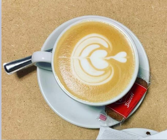
The coffee from the Tearooms

WORSBROUGH MILL WORKING MILL & COUNTRY PARK