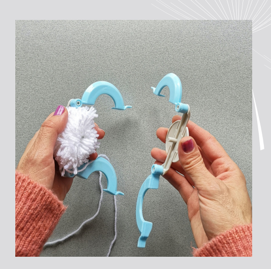
7. Holding the pom pom in place, with one hand, use the other to pull off one side of the pom pom maker.