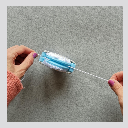
5. Cut a separate piece of wool, place it through the middle of the pom pom maker and tie a knot through, pulling tight.