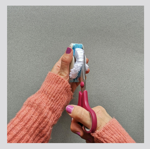
4. Close the pom pom maker fully, hold tight in one hand and cut along the middle of the semi circle carefully using sharp scissors. Ask an adult to do this.