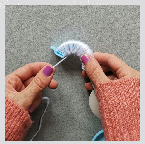
2. Wrap the wool around this half of the pom pom maker until you can't see the plastic underneath anymore. The more covered it is, the fluffier the pom pom.