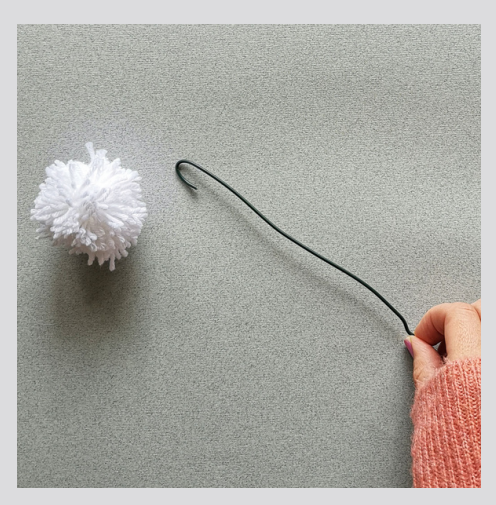
9. Take your wire and make a hook at the end. Hook it through your pom pom so that it catches in the wool and stays in place.