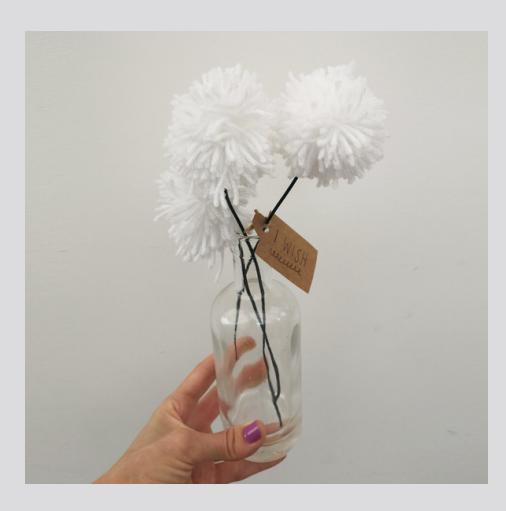
Keep inside in a vase.