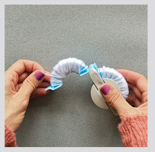
3. Close that wrapped half of the maker and open the other side. Repeat wrapping the wool around this half.