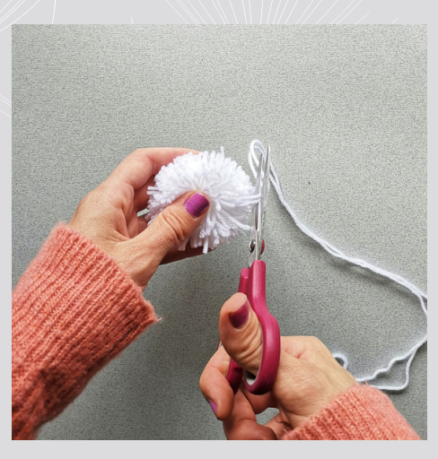
8. Trim the long piece of wool and give your pom pom a trim.