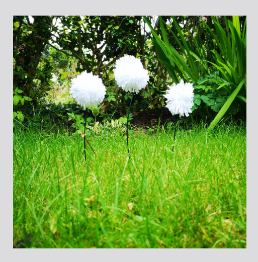
Or display outside amongst the flowers.