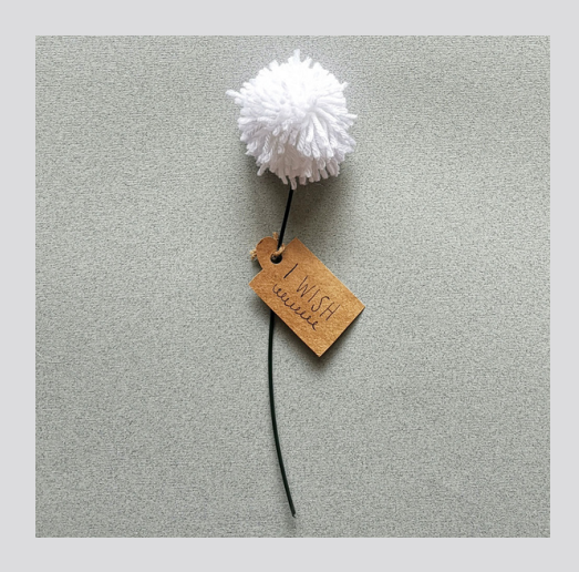
Write a wish on a label or a piece of card, with a hole punched through and attach to your stem with string.