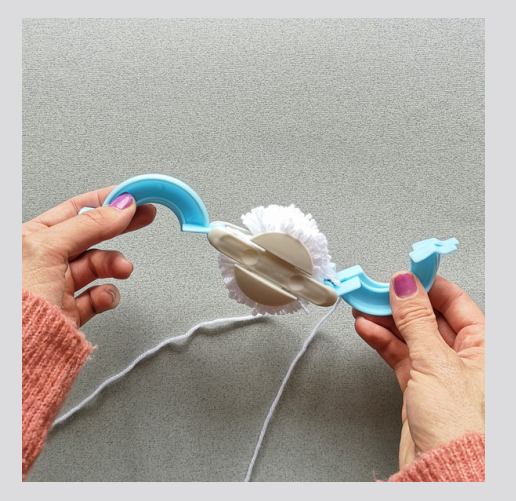
6. Open up the maker fully,