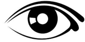
Paintings and Ceramics